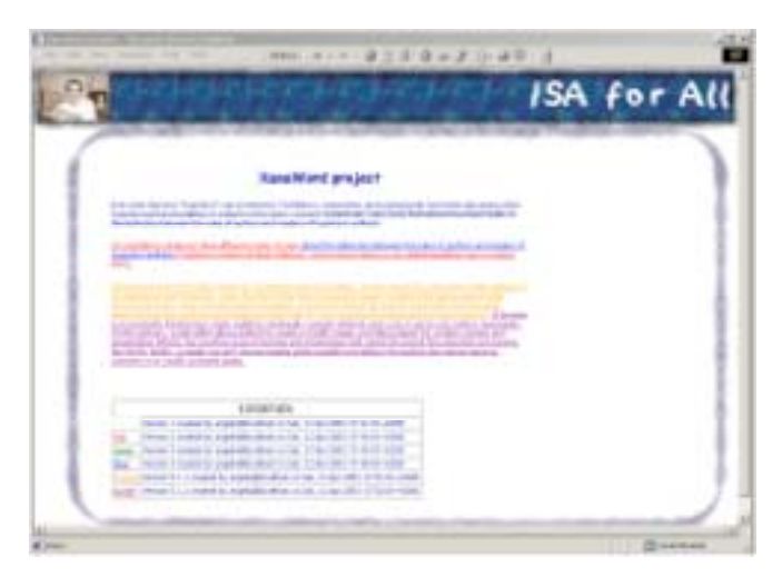
fig. 3 Showing multiple version of a XanaWord document