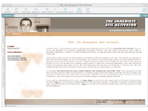
Figure 1: Drawing and slicing a layout and the final Web page created by ISA