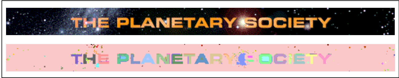
Figure 2. Example image and result